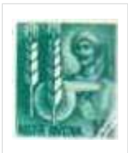
Technology in Agriculture Series = "C"

TI : 10-03-80 (14½x14) TII : 25-03-81 (14½x14) TIII : 05-07-82 (13x13)