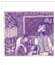
Adult Education (Litho)

TIA : 31-03-80(14x14½) TIB : 25-03-81 (13x13)