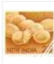
Poultry Series = "J"

TI : 29-11-79 (14½ x 14) TII : 05-07-82 (13 x 13)