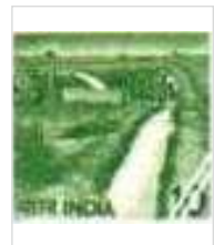
Minor Irrigation "B" Series = "B"

TI : 25-01-82 (14½x14) TII: 05-07-82 (13x13)