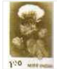
Hybrid Cotton Series = "R"

TI : 17-06-80 (14½ x 14) TII : 07-12-80 / 10-11-83 (13 x 13)