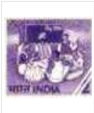
Adult Education (Photo) Series = "X"

TIA : 31-03-80(14x14½) TIB : 25-03-81 (13x13)