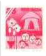
Family Planning Series = "K"

TI : 15-09-80 (14½ x 14) TII : 05-07-82 (13 x 13)