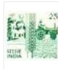
Tractor Series = "J"

TI : 29-11-79 (14½ x 14) TII : 05-07-82 (13 x 13)