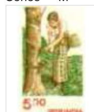
Rubber Tapping Series = "M"

TI : 23-11-80 (14½ x 14) TII : 11-08-83 (13 x 12½) ?