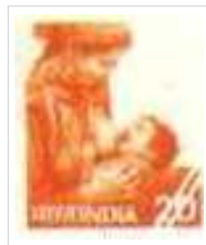
Mother & Child Series = "D"

TI : 25-03-81 (14½ x 14) TII : 05-07-82 (13 x 13)