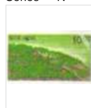
Afforestation Series = "N"

TI : 23-11-80 (14½ x 14) TII : 11-08-83 (13 x 12½) ?