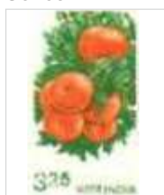
Oranges Series = "L"