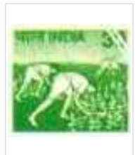
Harvest Series = "P"

TI : 03-09-79 (14½ x 14) TII : 06-09-82 (13 x 13)