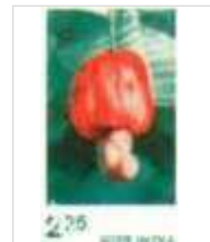
Cashew Series = "T"

TI : 25-03-81 (14½x14) TII : ? (13 x 13)