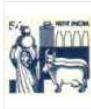
Dairy Series = "G"

TI : 25-01-82 (14½ x 14) TII : 05-07-82 (13 x 13)