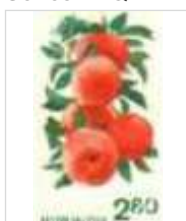
Apples Series = "Q"

TI : 25-03-81 (14½x14) TII : ? (13 x 13)