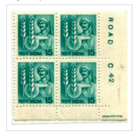
15p: Cylinder No C42