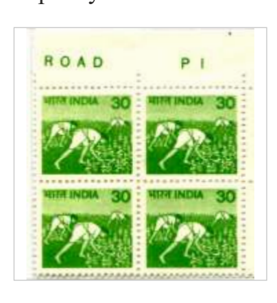
30p: Cylinder No P 1