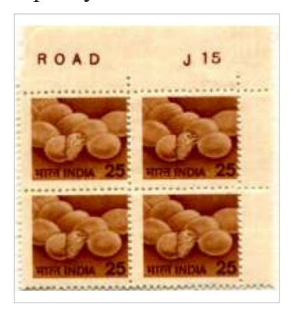
25p: Cylinder No J 15