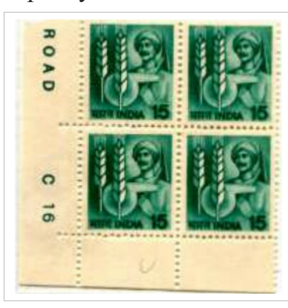
15p: Cylinder No C 16