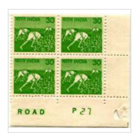
30p: Cylinder No P 27