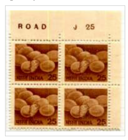
25p: Cylinder No J 25