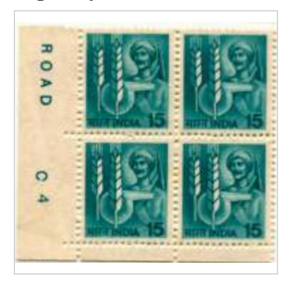
15p: Cylinder No C 4