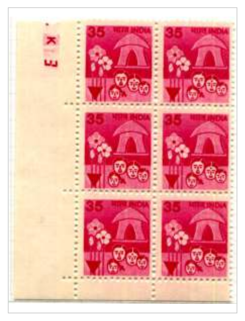
Film on 'K'