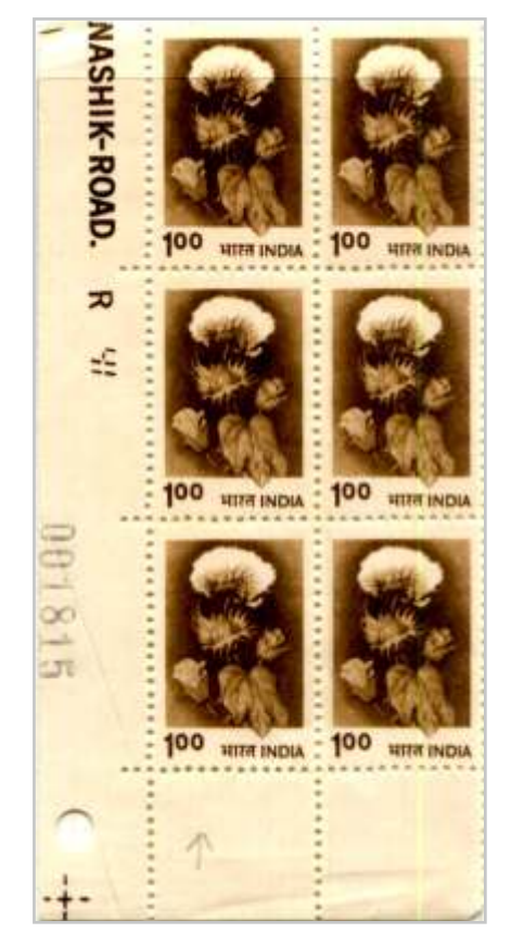
Bold 'R' of R 41