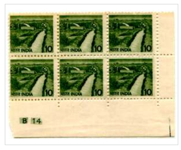
Ink "Clouds" on this Margin