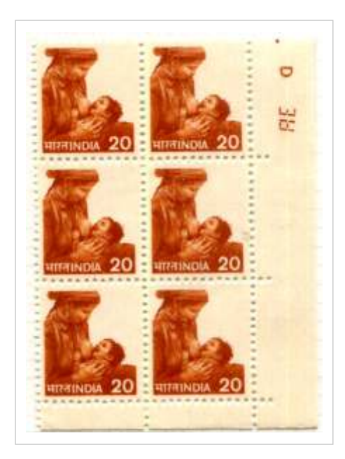
Broken '8' of D-38

V_2020-12-26_Updated