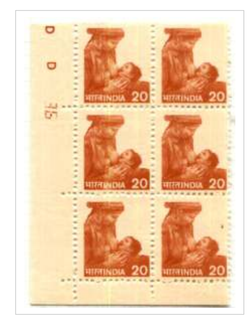
Miscut out - Bottom Imperf