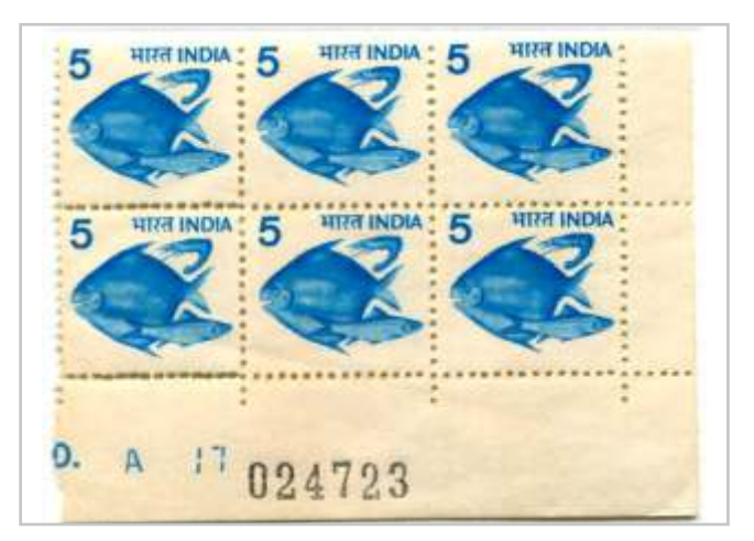
Joint '17' as 'U' Inverted