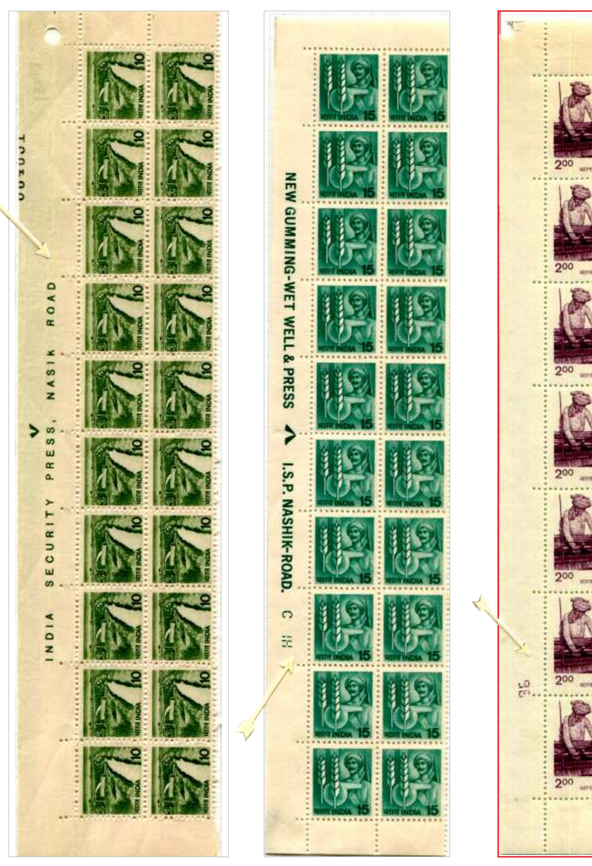
200p - S 96 Missing Inscription