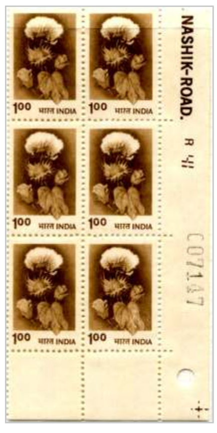
Normal R - 41