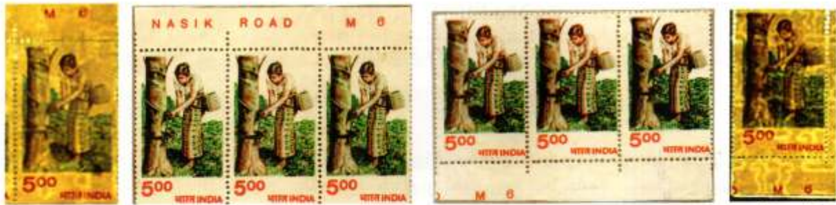
Printings from cylinder M 6 of first printing showing Sideways to Right and Upright position of watermark