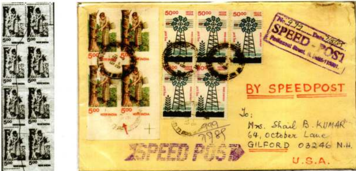
A speed post cover to Gilford, USA bearing an imperforate block of four

4. Perforation Error - Imperforates of this issue are very rare and only one used block of four on a Speed Post cover and a vertical strip of three are known. Block of 4 used on a Speed Post cover and a photocopy copy of Imperforate vertical strip of three are shown below: