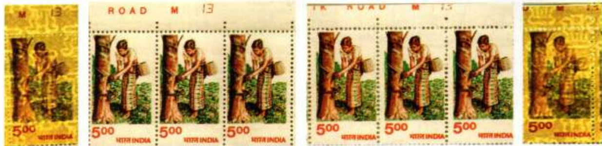
Printings from cylinder M 13 of second printing showing Inverted and Upright position of watermark

The yellowish stamps on either side of three rows of stamps above are stamps photographed against light to bring out the watermark