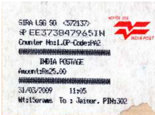
① Type IA - Small size Logo