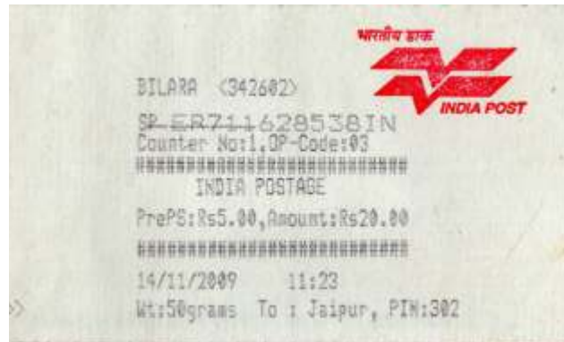
② Type IB - Large size Logo