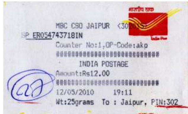
④ Type 2 Bi-Colour Logo