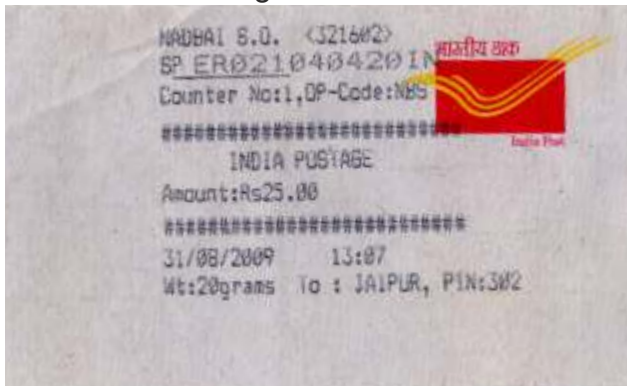
③ Type 2 Bi-Colour Logo