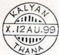
Type A23 Ba. Despatch code before date.