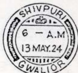
Type A27 B (CON) Office name in upper half, state name in lower half. Gwalior has coiled cobras in upper segment.