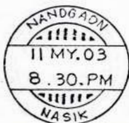
Type A24 B Office name in upper, district or head in lower.