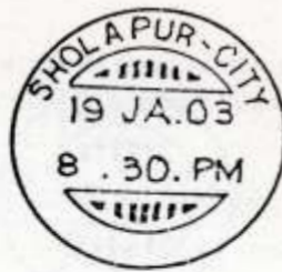
Type A24 D Line's enclosing date stop short of inner circle.