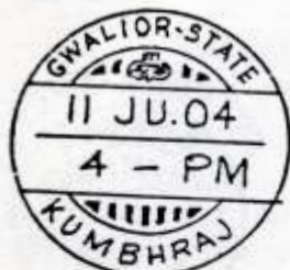
Type A24 Ba (CON) As for A24 B, but coiled cobras in upper bars.