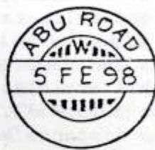
Type A23Ae. Despatch code in upper obliterator bars