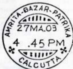
Type A24 Dc. Names divided by crosses.