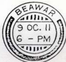
Type A27 A General type