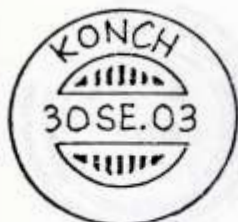
Type A23 D Lines enclosing date stop at inner circle.