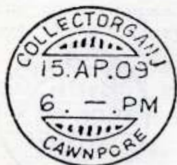
Type A24 Db. With head or District office in lower half.