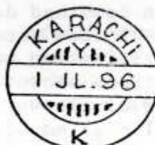
Type A23Af. As for A23Ae, but code letter in lower half.