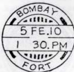
Type A24 Ba With 'killer' arcs between names.