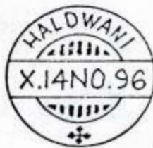
Type A23 Cc. Despatch code before date.