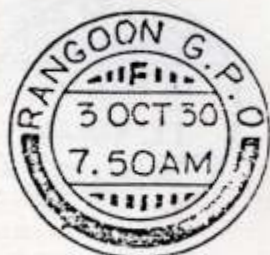
Type A27 Aa With code letter in upper segment.