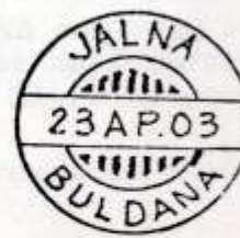
Type A23B Office name in upper, district or head office in lower half.