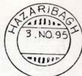
Type A24 Da. Inner circle complete.