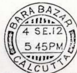
Type A27 B Office name in upper half, district or head office in lower half.