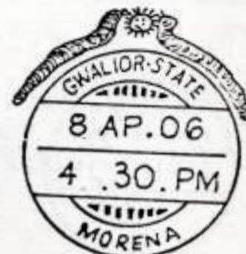
Type A24 B (CON) State name in upper, office in lower, with Sun and Cobras for Gwalior