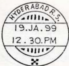
Type A24 Ca. Design, five squares joined together