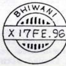
Type A23Ab Despatch code before date.