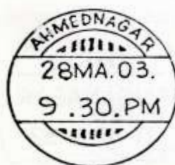
Type A24 A General type