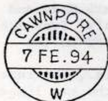
Type A23Ad. Despatch code in lower half.