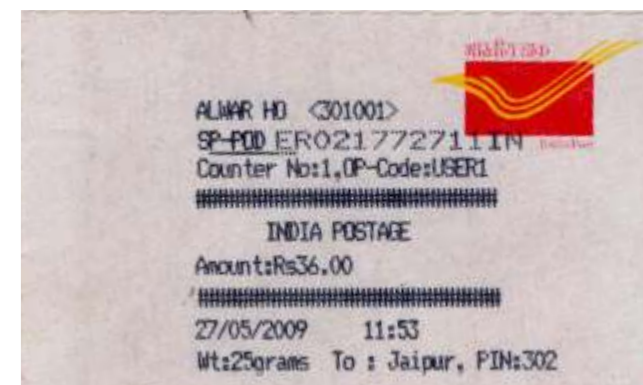
Colourful Obverse of P.O.D.