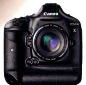
CANON EOS-1D X